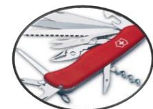
Swiss Army Knife for multiple purpose survival