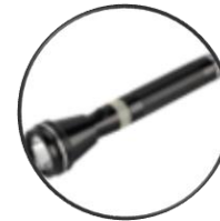
Torch light & Batteries