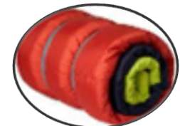
Blanket & sleeping bag