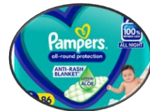
Diapers for baby / adult