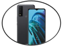
Mobile Phone & Power bank

In preparing for unexpected events, WOWriors residing at the high risks area are advised to prepare a Flood Emergency Bag. Suggested items for the Emergency Bag are as per below: