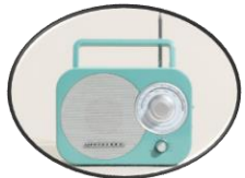
Mini radio (battery powered)