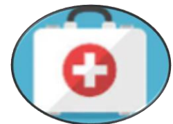
First aid supplies