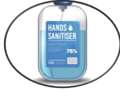
Hand sanitizer & face mask