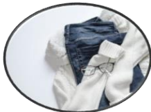
Clothes & shoes